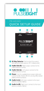
Quick Start Guide